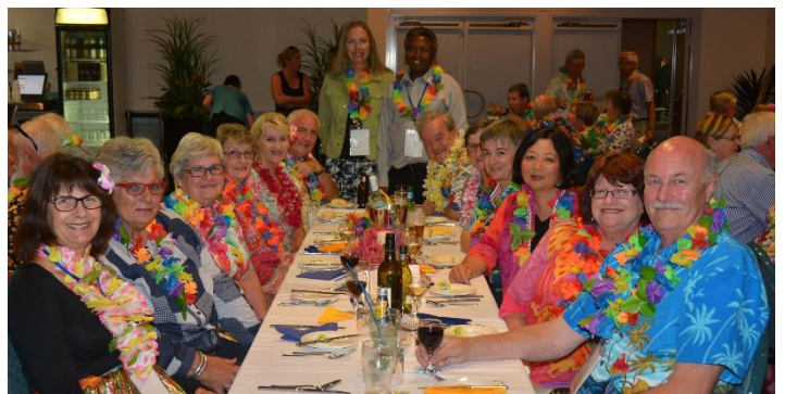
... from the archives (Halloween 2015)